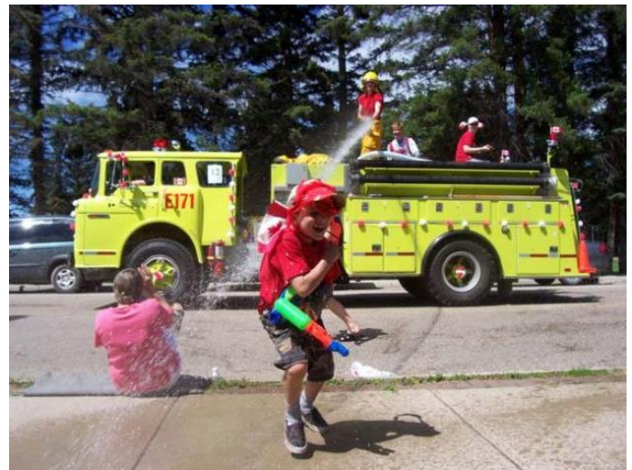
This and other great pictures are in the Photo Galley found on Waskesiu.org .