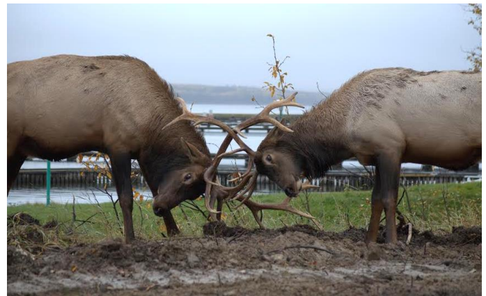
at the Waskesiu Marina

For more information about these or other topics, please call the Townsite office at 306-663-4520 for assistance.