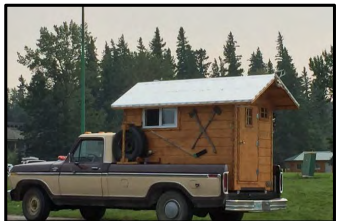
A seasonal resident?

Our website is housed within Waskesiu.org, at http://www.waskesiu.org/seasonal_residents.html . Our email address is waskesiusra@gmail.com