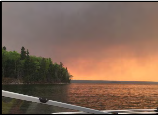
The Rabbit Creek Fire was visible from the lake during the height of concern

Rabbit Creek wildfire was a prominent event in 2018. While the event was not without its stresses for both seasonal residents and Parks Canada, it provided some significant benefits as well. Fire is a natural part of the boreal ecosystem and is required by plant species such